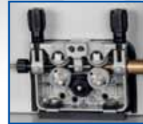
Polyfil-3 drive mechanism