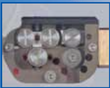
Polyfil Compact drive mechanism with wire straightening system