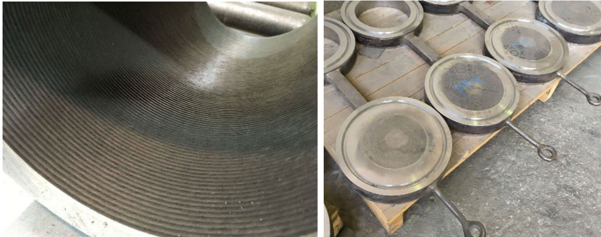
Fig. 4: High speed and top quality

The resulting smooth overlay surface and weld deposit chemistry meet with the most stringent welding specifications and codes in the industry, resulting in the TIG er being used today in Oil & Gas, Subsea/Offshore, Nuclear, and Military applications. It has received approval by some of the most esteemed and coveted major engineering firms, contractors, fabricators and third parties around the world.