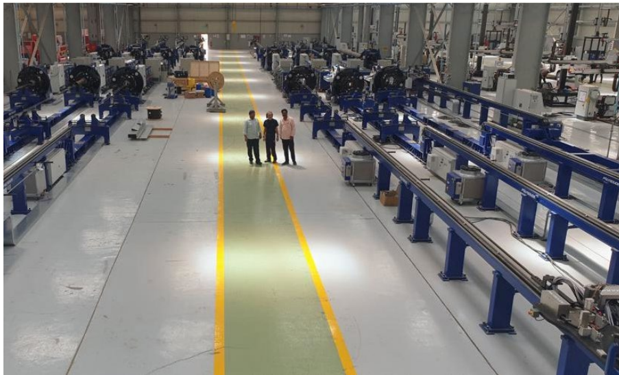
Fig. 2: Production hall with horizontal 12m TWIN-TIGer rigs

Through simplification of the overall system, required maintenance and service support needs are greatly reduced, making the TIG er solution ideal for every application, no matter how big or small. This technology is just the perfect solution for small, medium, or large companies.