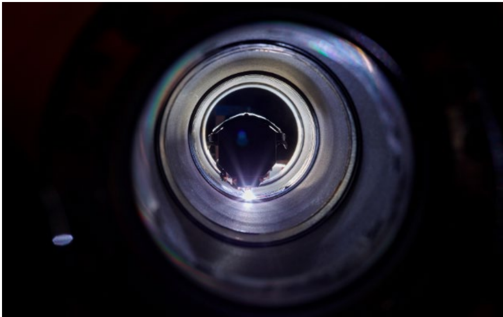
Fig. 1: TIG er weld overlay lance

Now Delivering the Future of Weld Cladding!